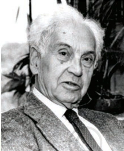
Ernst Mayr (1904 – 2004)

Born on 5 July 1904, in Kempten, Germany, ERNST MAYR, the Harvard University evolutionary biologist who has been called 'The Darwin of the 20 th century', was one of the 100 greatest scientists of all time. Mayr joined Harvard's Faculty of Arts and Sciences in 1953 and retired in 1975, assuming the title Alexander Agassiz Professor of Zoology Emeritus . Throughout his nearly 80-year career, his research spanned ornithology, taxonomy, zoogeography, evolution, systematics, and the history and philosophy of biology. He almost single-handedly made the origin of species diversity the central question of evolutionary biology that it is today. He also pioneered the currently accepted definition of a biological species. Mayr was awarded the three prizes widely regarded as the triple crown of biology: the Balzan Prize in 1983, the International Prize for Biology in 1994, and the Crafoord Prize in 1999. Mayr died at the age of 100 in the year 2004.